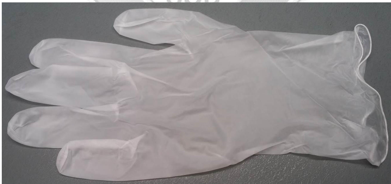
Photo : Vinyl Gloves, Clear, Size M